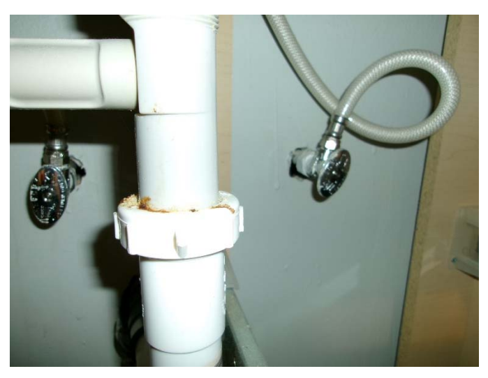
Toilet Shut-off Valve