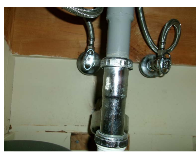
Toilet Shut-off Valve