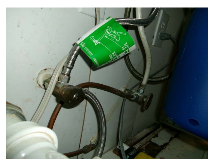
Washing Machine Plumbing