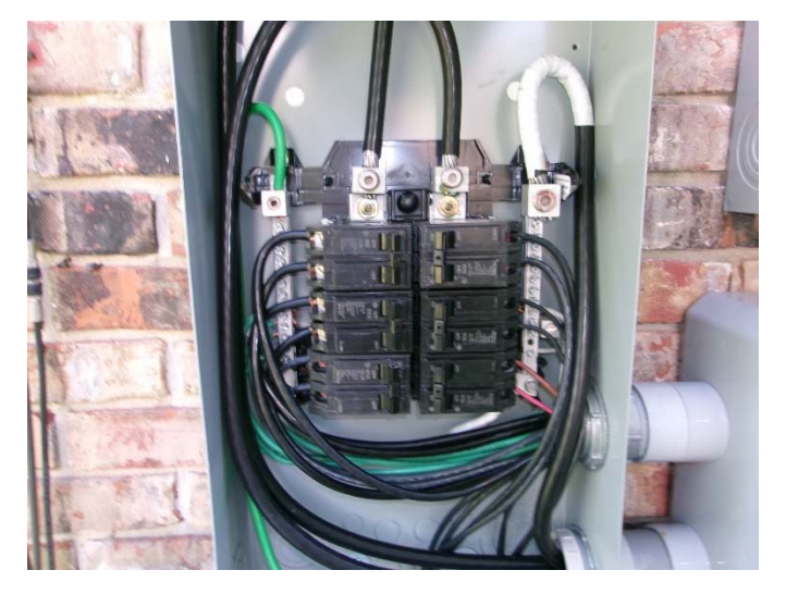
Siemens Subpanel – Copper Branch Wiring