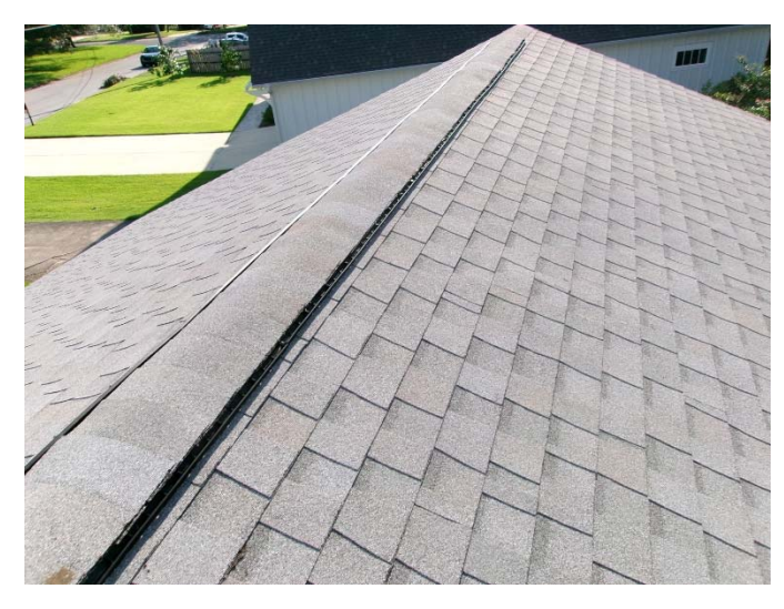
Roof View – Photo 3