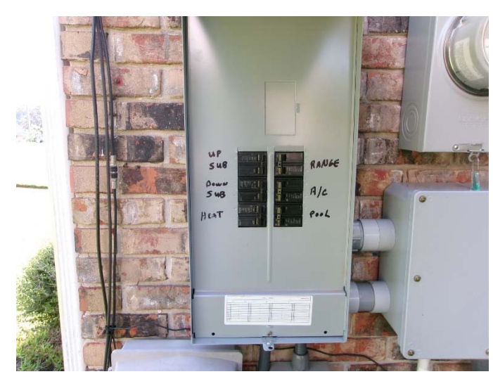
Siemens Subpanel – Front Cover