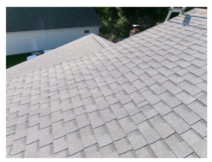
Roof View – Photo 4